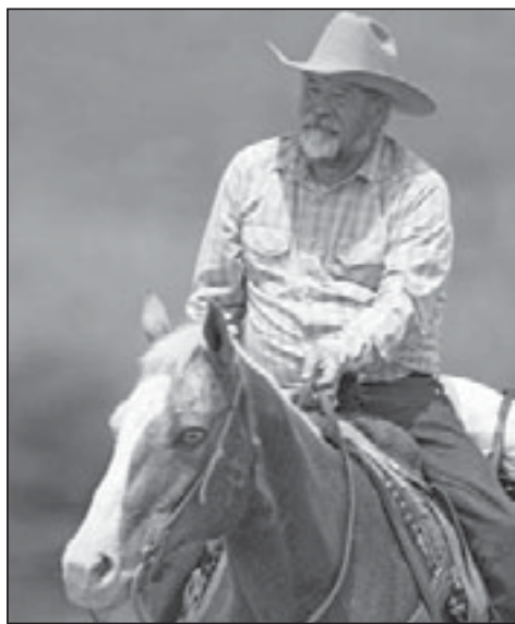
Actor Barry Corbin and his horse, Chip.

"I wanted Barry Corbin for the part of Hank because he is a true horseman and I knew he would understand the character. It turns out, Barry is also a dream to work with. He is a