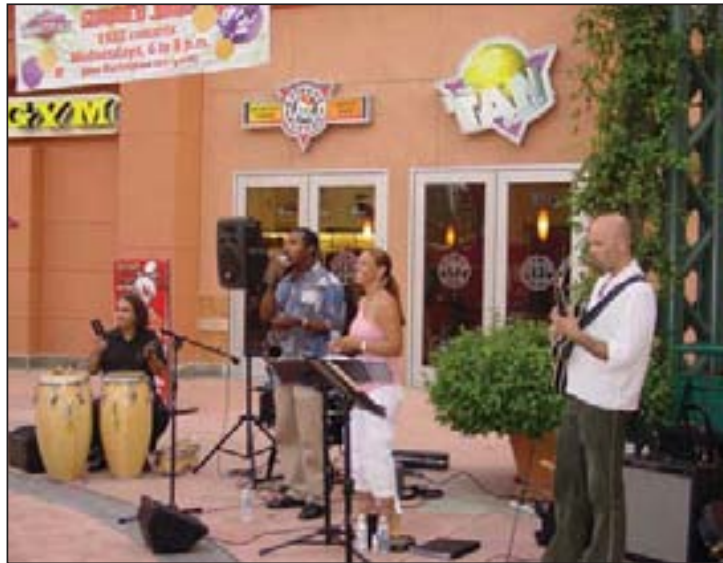
The Early McCallister Band preforms as a part of the Summer Nights Concerts Series at the Janss Marketplace in Thousand Oaks.

Janss fountain. This year several talented bands, including "Yesterday and Today," a Beatles tribute band, "Hollywood Stones," a Rolling Stones tribute band, "Urban Dread" a Reggae band, will be featured, along with other music. For event information, please call the event hot line at 805-495-4662 or visit the Website at www.janssmarketplace.net .